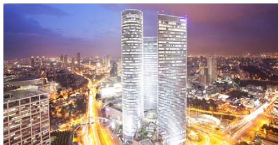
The conference venue for PPS-2014 is the David Intercontinental Hotel in Tel Aviv, Israel.