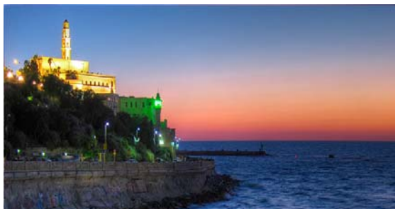
Tel Aviv and its exciting coastline in eastern Mediterranean is the site for the 2014 Europe-Africa Conference of PPS.

conference tours will be organized for those participants who want to take the opportunity and visit such places as Jerusalem, the Dead Sea, and the many other attractions present in the Holy Land.