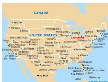
Map of USA, showing Cleveland, the site of PPS-30, which is located in Ohio State, northern USA.

The City of Cleveland is located on the southern side of Lake Erie. It was founded in 1796, has an area of 82.47 square miles, and has a metropolitan population of about 2 million. The full program and further information on all topics (hotel, travel, public transport) are available on ( http://www.pps30.com/ ).