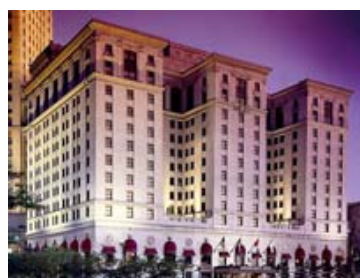
The Renaissance Hotel, venue for PPS-30.