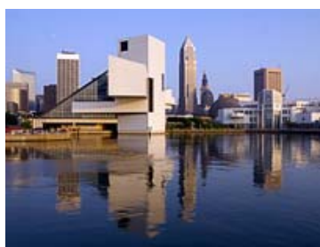
The Cleveland skyline. The city offers exciting places and museums to visit.