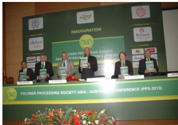
Release of Conference Proceedings at the inaugural program during PPS-2014 meeting in Mumbai, India.