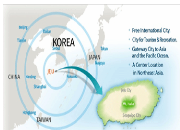
Map of North Pacific, showing Jeju Island, the site of PPS-31, which is located off the southern tip of Korea.

The island of Jeju, the largest island of Korea, is located off the southern side of Korea. The island contains the natural World Heritage Site Jeju Volcanic Island and Lava Tubes. Jeju island has a temperate climate the whole year round and lovely beaches and scenery. It has a population of about 600,000 inhabitants.