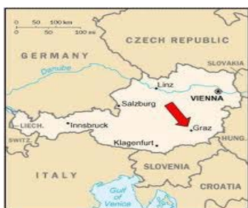
Map of Austria, showing Graz, the site of PPS-2015.