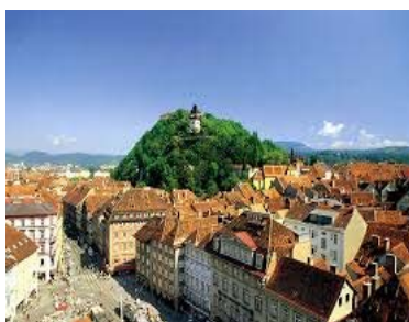
Down town Graz with its castle hill.