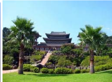
A typical Korean landscape + building on Jeju Island, where PPS-31 will take place.