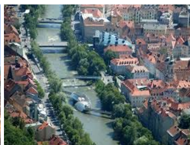
Down town Graz with the river Mur passing through it.