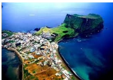
A remarkable site on Jeju Island, which offers exciting places and beaches to visit.