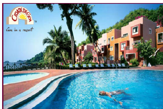
Two views of the Hotel Cidade de Goa, the venue of PPS-25, right on the beach overlooking Goa Bay.