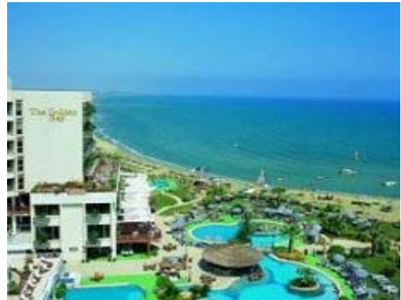
View of the Golden Bay Beach Hotel in Larnaca, Cyprus, venue of the PPS-2009 Regional Meeting.