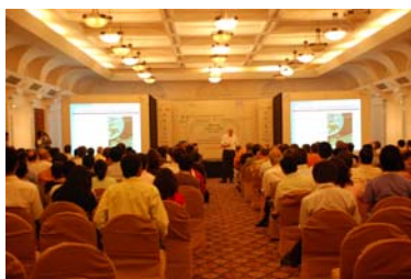
Plenary session in progress in Grand Sala Auditorium.