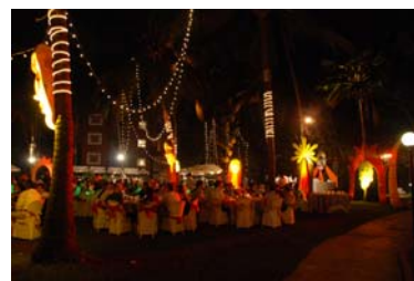
The banquet featuring Goa Carnival took place in the gardens of the venue hotel by the beach. Indian food and great dancing was enjoyed by all.