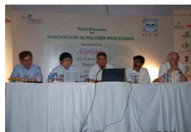
Panel discussion on "Innovation in Polymer Processing" was the new theme in PPS-25 and attracted large participation by the delegates.