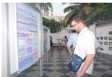
The poster sessions, organized on the 1 st and 3 rd day, were well attended, involving selection of 6 Best Poster Awards.