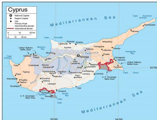
Map of the island of Cyprus in the Eastern Mediterranean. Larnaca in the south is the site of the Europe/Africa Regional Meeting 2009 of the PPS.