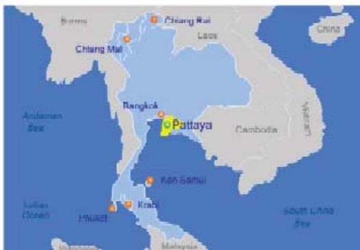
Map of South East Asia, showing Thailand and Pattaya, the site of PPS-28, which is located 150 km (90 miles) south-east of Bangkok.

Pattaya is a popular beach resort on the Gulf of Thailand just 150 km southeast of Bangkok: a mere two hour drive. From Bangkok International Airport, the organizers have arranged for transportation to Pattaya, and it can be found in http://www.mtec.or.th/pps-28/how-to-get-there . Pattaya draws visitors from around the world. With activities that include: a wide array of water sports, golf, shopping, cabaret shows, an elephant village, and a Ripley's Believe it or Not museum (to name only a very few) it is possible to enjoy Pattaya in parallel with a truly outstanding technical program.