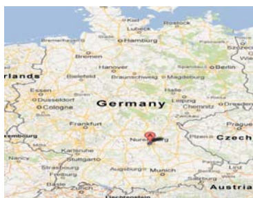
Map of Germany, showing Nuremberg, the site of PPS-29, which is located in northern Bavaria.

The 2 nd announcement for the meeting is already posted on the website, with the names of sessions, invited plenary and keynote speakers, and special symposia. The deadline for abstracts is December 20, 2012.