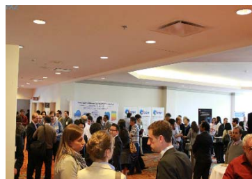
An overall view of the poster session during PPS-2012.