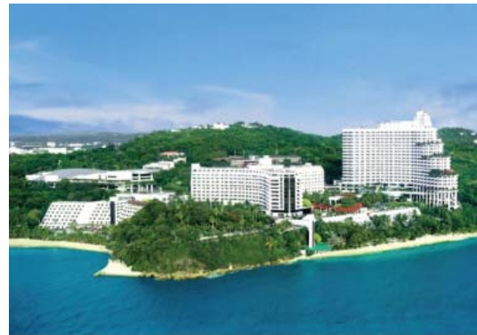
The Royal Cliff Beach Resort, venue for the PPS-28 International Conference, is a world-class hotel and conference facility located right at sea in the Gulf of Thailand.