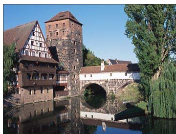
The old city of Nuremberg offers exciting medieval sites and many museums to visit.