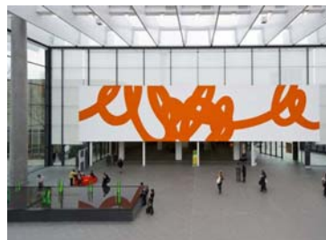
The newly opened Nuremberg Conference Center is a world-class conference facility and is the venue for PPS-29.