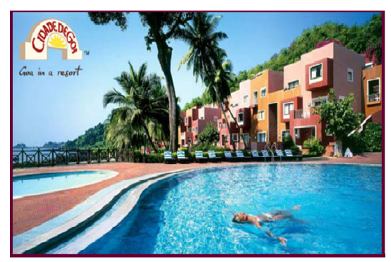
Two views of the Hotel Cidade de Goa, the venue of PPS-25, right on the beach overlooking Goa Bay.