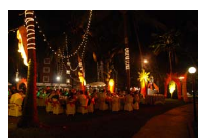
The banquet featuring Goa Carnival took place in the gardens of the venue hotel by the beach. Indian food and great dancing was enjoyed by all.