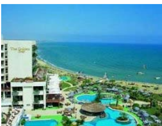
View of the Golden Bay Beach Hotel in Larnaca, Cyprus, venue of the PPS-2009 Regional Meeting.